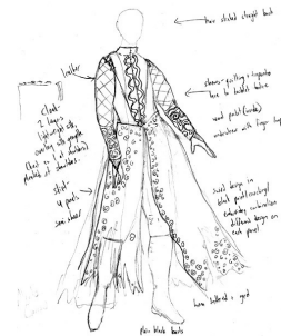
Costume designs for film and book characters