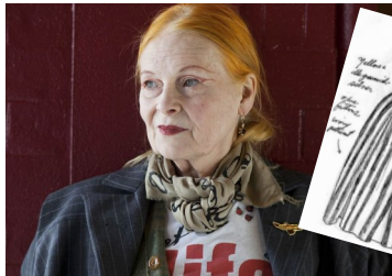
Dame Vivienne Westwood