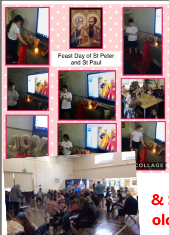
Feast Day of St Peter and St Paul