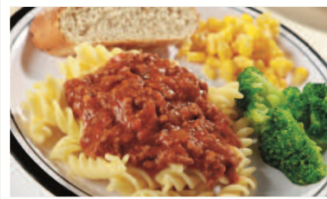
Pasta Bolognese served with Garlic & Herb Bread and Seasonal Vegetables