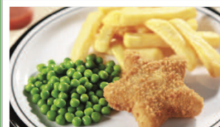
Fish Star (MSC) served with Chips & Peas or Baked Beans

VEGETARIAN VERSIONS OF THE ABOVE MEAL AVAILABLE DAILY