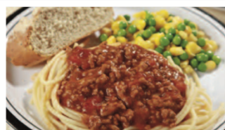
Spaghetti Bolognese served with Garlic & Herb Bread and Seasonal Vegetables