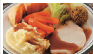
Roast Pork served with Roast/Mashed Potatoes, Seasonal Vegetables & Gravy