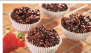
Chocolate Crispy Cake