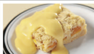
Peach Crumble Slice & Custard