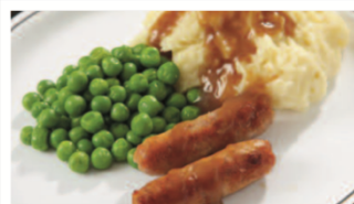
Sausages served with Mashed Potato, Seasonal Vegetables & Gravy