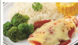
BBQ Chicken served with Savoury Rice and Seasonal Vegetables