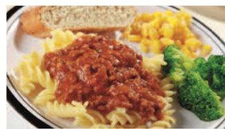
Pasta Bolognese served with Garlic & Herb Bread and Seasonal Vegetables