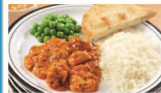
Chicken Tikka Masala served with Rice, Naan Bread & Seasonal Vegetables