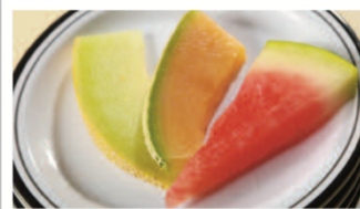
Trio of Melon