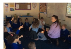
Today we focused on the Great Commandment "Love the Lord your God with all your heart and your neighbour as yourself" (Mark 12:29-30)