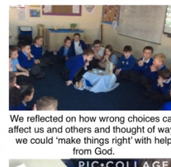
We reflected on how wrong choices can affect us and others and thought of ways we could 'make things right' with help from God.