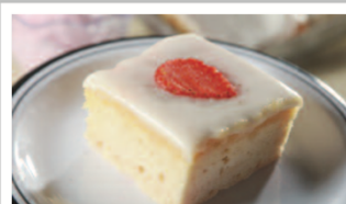
Strawberry Ice Cream Cake