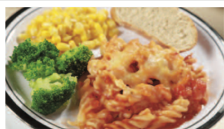
Cheese & Tomato Pasta served with Garlic & Herb Bread and Seasonal Vegetables