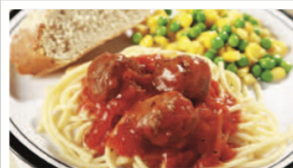
Meatballs in Tomato Sauce served with Spaghetti, Garlic & Herb Bread and Seasonal Vegetables