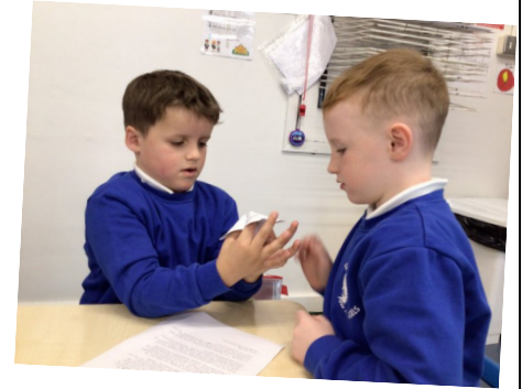
Year 2 have been using the artefacts from Port Sunlight museum to re-enact a Victorian washday, using Sunlight soap of course!

Year 2 have also used fortune tellers with conjunctions hidden behind each door. They generated sentences that would hopefully convince the king not to ban the dark and include a conjunction!