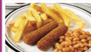
Breaded Mozzarella Sticks served with Chips & Peas or Baked Beans

VEGETARIAN VERSIONS OF THE ABOVE MEAL AVAILABLE DAILY