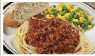
Spaghetti Bolognese served with Garlic & Herb Bread and Seasonal Vegetables