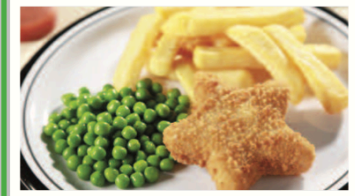
Fish Star (MSC) served with Chips & Peas or Baked Beans

VEGETARIAN VERSIONS OF THE ABOVE MEAL AVAILABLE DAILY