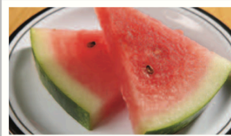
Fresh Water Melon Wedge