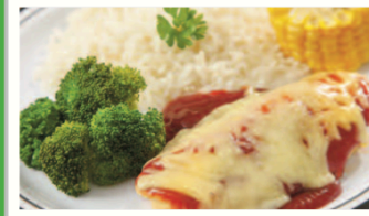
BBQ Chicken served with Savoury Rice and Seasonal Vegetables