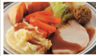
Roast Pork served with Roast/Mashed Potatoes, Seasonal Vegetables & Gravy