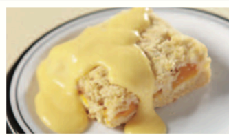
Peach Crumble Slice & Custard