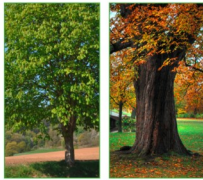
Horse chestnut Summer Horse chestnut Autumn

In autumn some trees lose their leaves. There is a variety of insects and mini-beasts around our local area. We use our senses to consider what clothing to wear during different seasons of the year. Different seasons have different weather patterns.