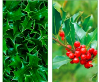
Holly Summer Holly Autumn