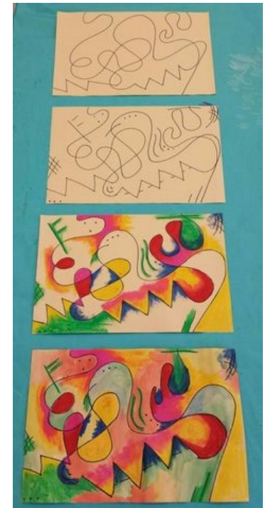
Building a sequence of works based on Kandinsky