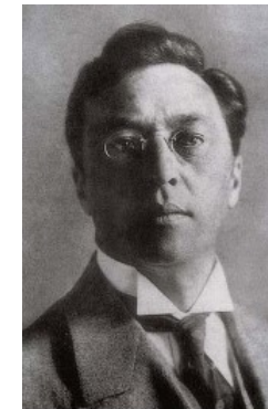
Wassily Kandinsky (1866-1944)