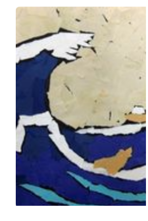
Layering with paper

Painting and adding beads, sequins and glitter.