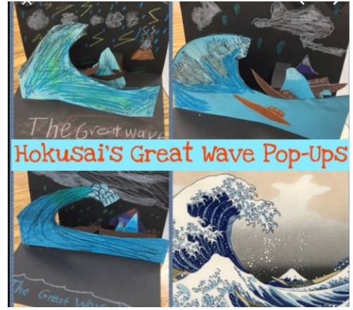
Hokusai's Great Wave