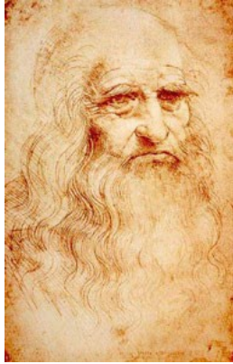
Leonardo Da Vinci self portrait