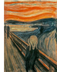
Exploring how colour creates the mood of the picture