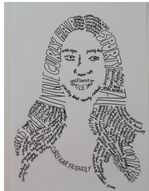
Using the technique of micrography to create a word portrait