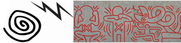
Using lines to express feelings