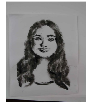
Using our fingerprints to create our portrait