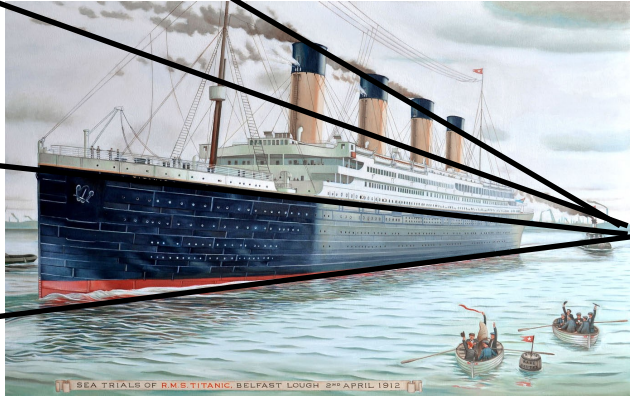
Lines of perspective