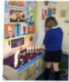
Y6 Stations of the Cross Collective Worship